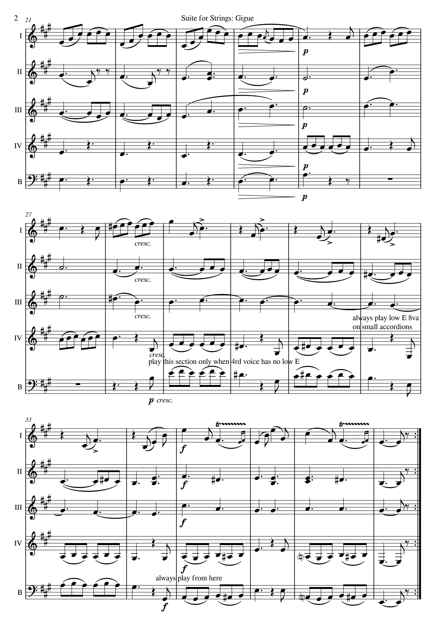
Creative Commons Attribution