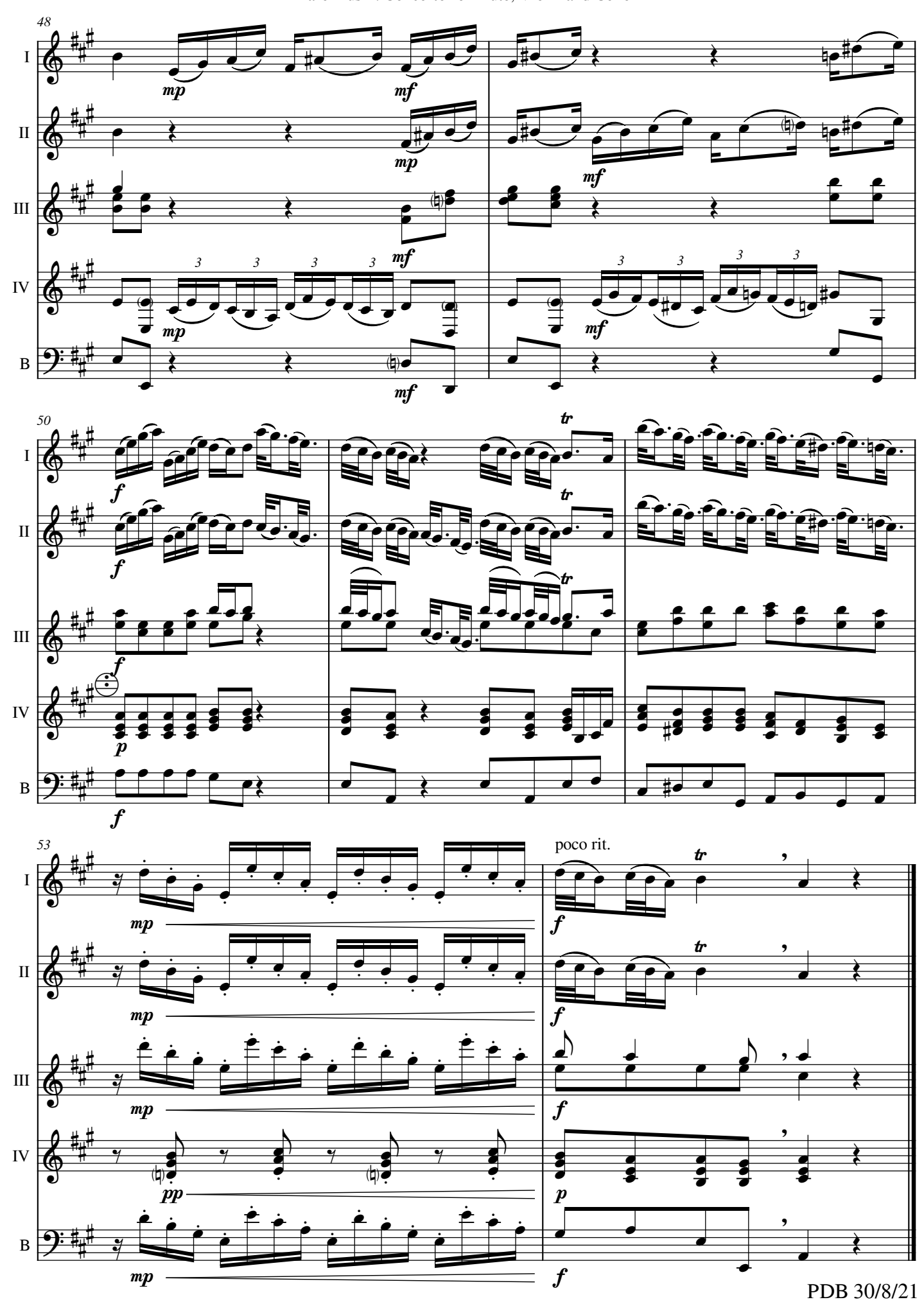
For more arrangements, check out www.de-bra.nl/arrangements.html Creative Commons Attribution