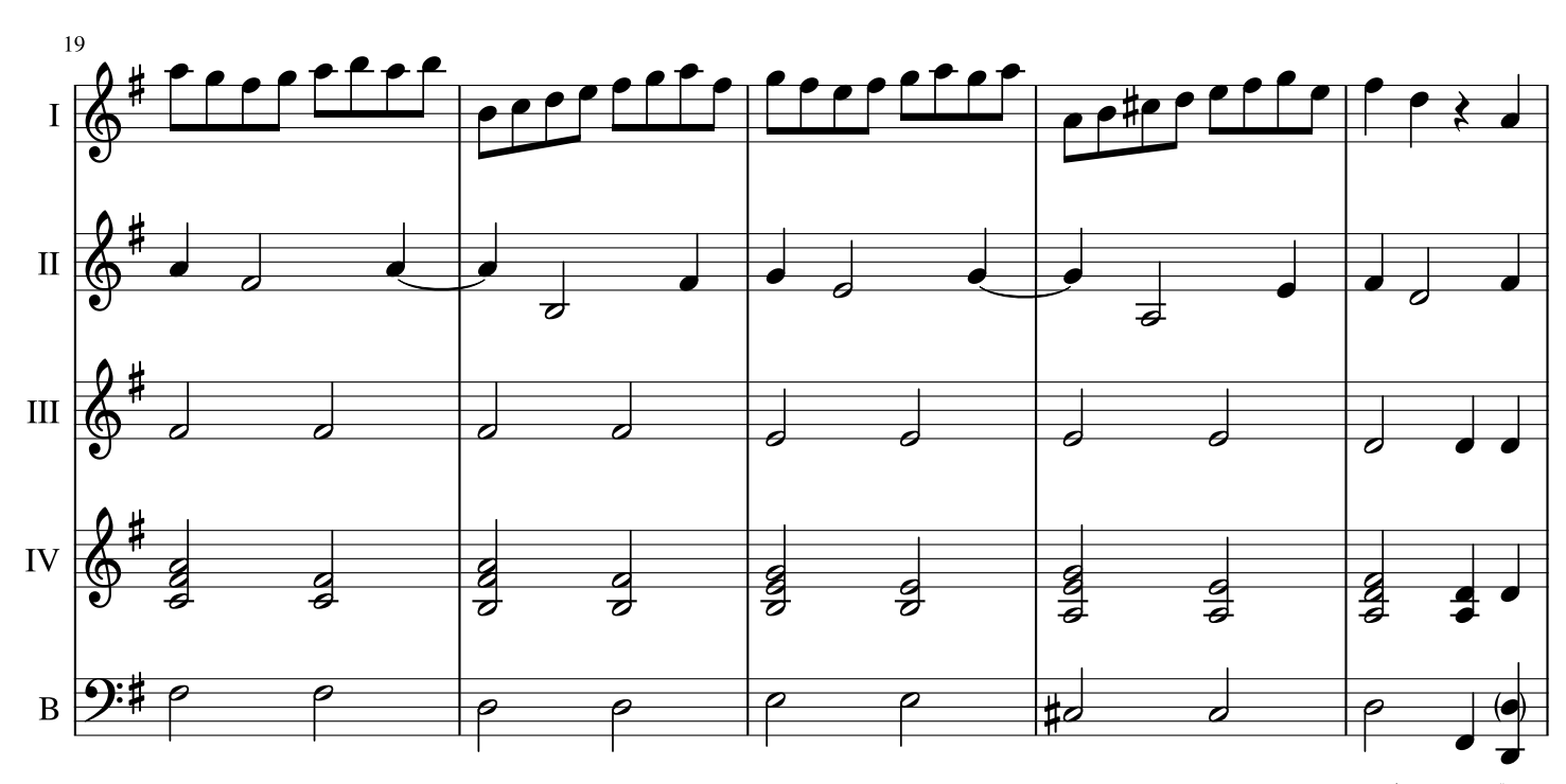
notes between () to improve response