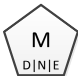
model D=descriptive N=normative E=executable