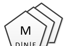
collection of models

See also Vision file: http://wwwis.win.tue.nl/~wvdaalst/etc/BPM-Use-Cases/20-use-cases.vsd