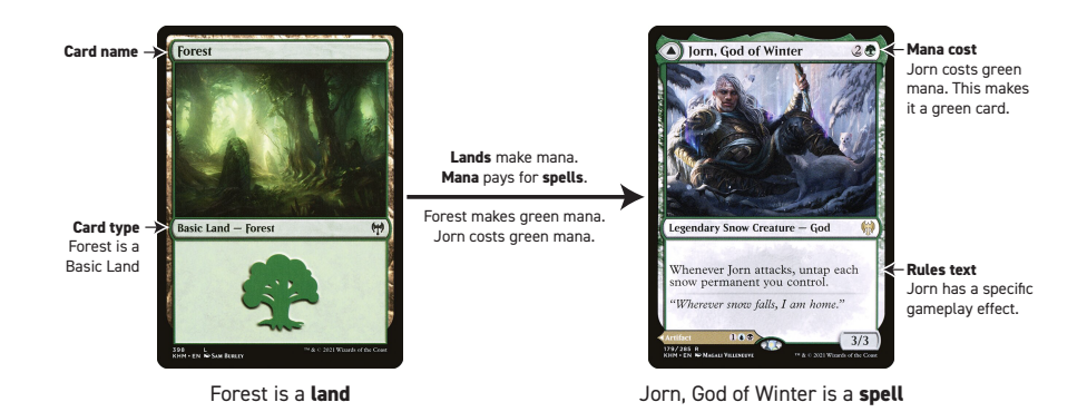
Fig. 1: Two example Magic cards. On the left hand, a basic land that provides mana of a specific color (in this case: green). On the right hand, a spell that can be played when the mana cost is paid, some of which must be in specified colors (in this case: two mana of any color plus one green mana). In this example, the Forest can contribute to paying the cost for Jorn, God of Winter.